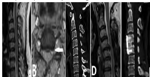
Figure 2: 43 years old female patient. Neck and left arm pain

One of the patients with a ruptured disc hernia, and three of the patients with foraminal stenosis underwent ADCF with anterior intervention in a postoperative year ( Figure 2 ).