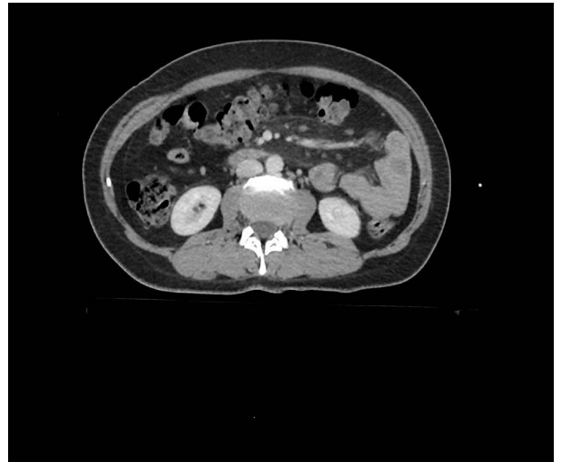
Figure 1. Contrast-enhanced CT scan shows a well-defined mesenteric fatty mass, lymph nodes within the mass, and a surrounding hyperdense pseudocapsule of MP in the left upper quadrant.

All statistical analyses were performed with SPSS statistics software version 24.0 (IBM Corp., Armonk, NY, USA).