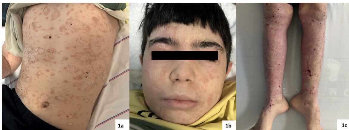
Fig. 1abc. Annular plaque on an erythematous base covered with squamae on the trunk and upper extremities, and squamous plaque lesions with erythema and a yellowish, greasy look around the eyes and on the scalp before treatment.

Dermatological assessment revealed annular, scaly, erythematous plaques on the trunk and upper extremity. Scaly, mildly erythematous-to-yellowish, greasy plaques were also noted around the eyes and scalp (Fig. 1abc). Upon the recent dermatological assessment a new punch biopsy was performed. The histopathological examination revealed parakeratotic foci on the surface, scale crust formations within parakeratoses and loss of granular cell layer immediately underneath the parakeratotic foci. There were granular cell layer of 2-3 lines in the non-parakeratotic areas. As well as irregular acanthosis, mild spongiosis, occasional lymphocyte exocytosis and focal suprapapillary thinning were seen. There were