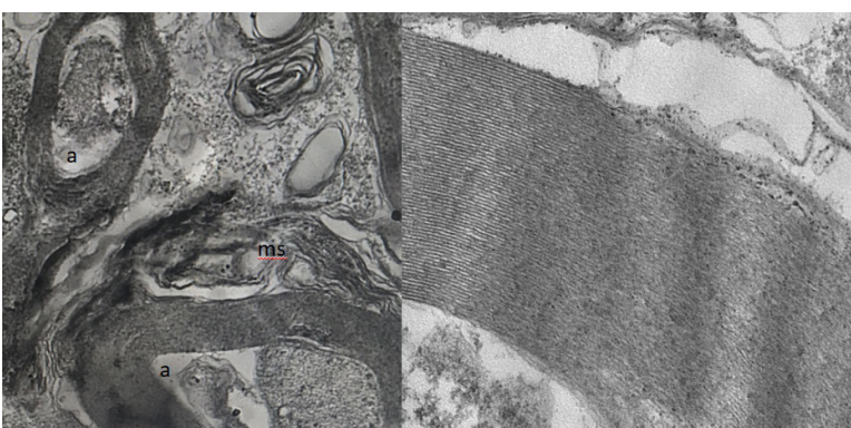
Fig. 3 - Electron microscopy examination of the spinal cord. The image on the left side shows a view of a subject from the I/R group. a: axonal/myelin separation and axoplasmic dissolution. ms: myelin separation. The image on the right side shows regular myelin sequences in the electron microscope view of a subject in the group that received propolis.

Note: cells stained brown show TUNEL-positive cells (arrow). (A), (B) 10x and 200 µm were used as the original magnification.