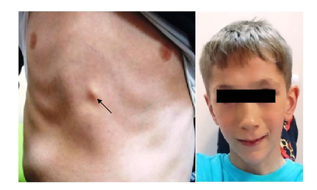
Fig. 3 NSD1 gene (p.Glu1970Metfs*6 (c.5908_5911delGAGT) novel mutation detected in patient (P14). At the tip of the arrow, there is a xyphoidal protrusion which may be specific to this mutation

The variant detected at P3 causes a non-sense mutation. It is classified as pathogenic according to ACMG criteria