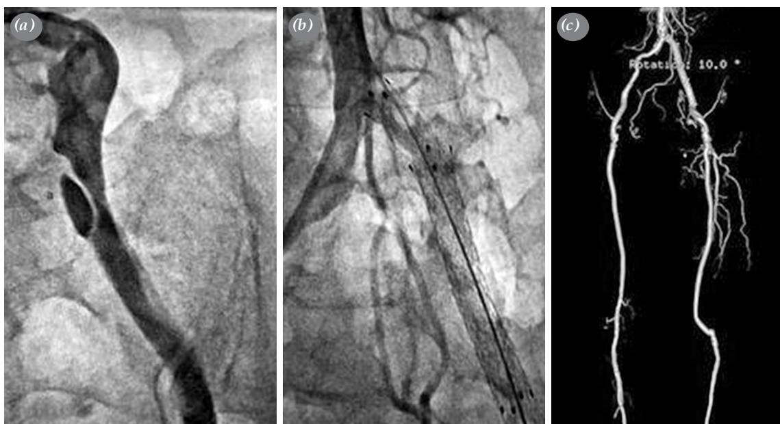
Figure 3. (a) Conventional angiographic image of the dissection in the common iliac artery. (b) Conventional image of the common iliac artery after endovascular treatment. (c) Detection of the patient's femoropopliteal bypass patency by three-dimensional computed tomography in the follow-ups after endovascular intervention to the left common iliac artery and left femoropopliteal bypass operation.

methods should be used in patients undergoing hybrid treatment. Although stent patency is achieved in these patients, extremity salvage depends on the success of hybrid treatment. As a result of our study, we suggest that hybrid treatment reduces mortality and morbidity in cases of dissection extending to the common femoral artery, in cases with >50\% maximal compression in the true lumen and in patients with a reduced ABI. Eight patients whose internal iliac artery was closed by endovascular intervention had no postoperative