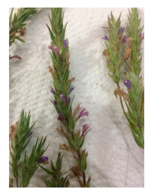
Figure 1. Image of the Z. taurica subsp. taurica.

Following our research on endemic plants used in traditional and folk medicine which could represent a valid source of bioactive components and their respective biological activities [11,12], the purpose of this research is to study the phytochemical profile of Z. taurica subsp. taurica , as seen in Figure 1, which has not yet been studied, and to assess its biological activity based on evaluations of its antioxidant and enzymatic activities.