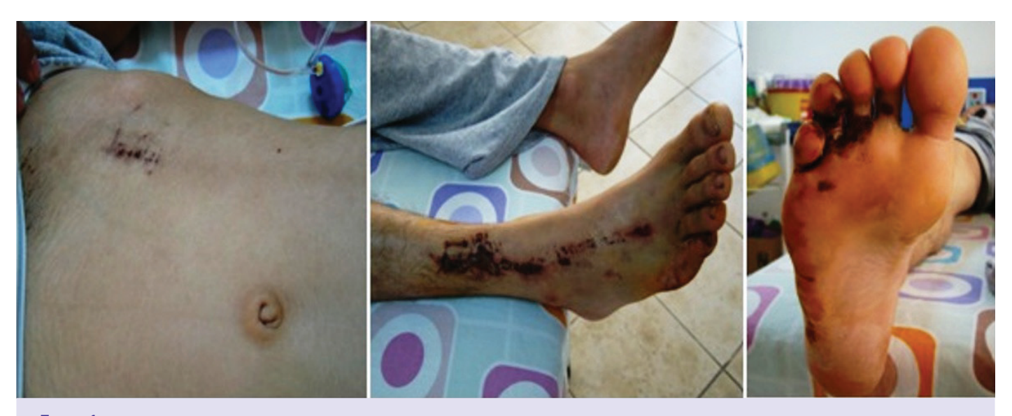
FIGURE 1 . Photographs showing entrance wound, 1 \text{ cm} \times 3 \text{ cm} in diameter, at 3 cm above the right groin, linear shaped seconddegree burns extending along the lateral of the right ankle and dorsolateral of the right foot, exit wound, 1 \text{ cm} \times 1 \text{ cm} in diameter, on the plantar region of the fourth toe of the right foot.