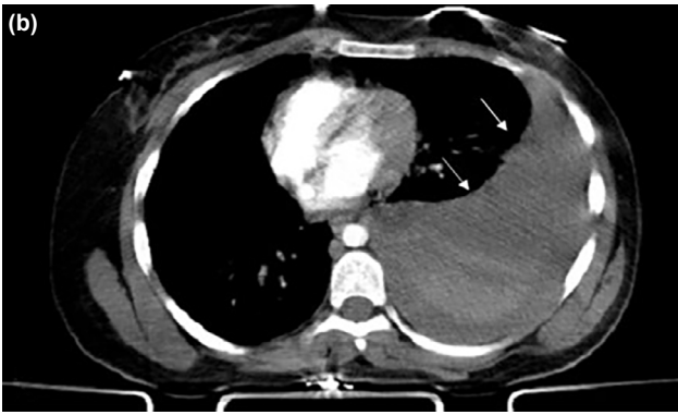
Figure 1. Axial CT images show (a) a round-shaped mass with 105 × 80 mm measured diameters (arrows) and (b) left-sided massive pleural effusion reaching approximately 9 cm (arrows).