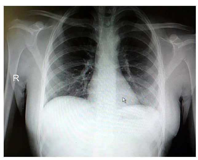
Figure 3. Normal chest X-ray image 1 month after discharge.

discharge. It was decided that surgical treatment was sufficient and adjuvant therapy was not required. On the chest X-ray taken I month after the patient's discharge, all previous findings disappeared and chest X-ray was normal (Fig. 3). The patient gave written informed consent.