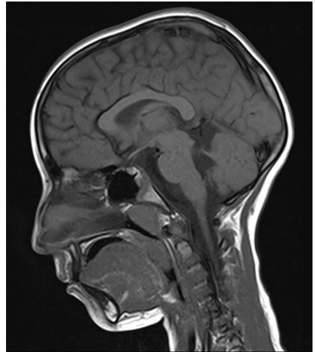
Figure 1. Brain MR images show cerebellar cyst and enlarged fourth ventricle. MR indicates magnetic resonance.

A total of 12 cases were reported in three publications for PTBHS (summarized in Table 1). Previously, in the study of Micalizz et al., PTBHS patients from Turkey have been reported. We did not include Table 1 because they did not evaluate patients one by one in their articles. In addition, Table 2 summarizes the clinical and MRI findings of patients including the study of Micalizzi et al.