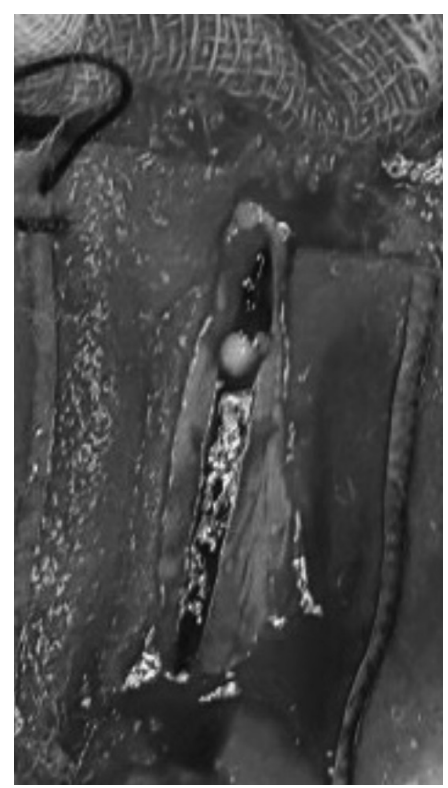
Figure 3. Edematous and ecchymotic appearance of spinal cord suggesting subarachnoid hemorrhage after dura was opened in surgery

Spinal hematomas are very rare and rapidly progressive disorders that cause permanent neurologic damage and death if not diagnosed and treated early. Its frequency is 1% among spaceoccupying lesions in spinal space (1). Coagulopathy, hypertension, anticoagulant or antiaggregant drug use, pregnancy, vessel abnormalities, and conditions causing and increase in intratorasic or intraabdominal pressure may be considered as causes of bleeding in patients with spinal hematoma (2,3). The first symptom in patients is usually pain. Typically, the pain is sudden onset, severe, and localized. Neurologic deficits are seen shortly after the pain due to compression on the spinal cord. Acute ruptured herniated disc, epidural mass, transverse myelitis, spondylitis, Guillain-Barré syndrome, epidural abscess, epidural SAH, vertebral fracture, and aortic dissection should be considered in the differential diagnosis in patients with neurologic deficits and pain (4). MRI is the gold standard imaging method in the diagnosis of spinal hematoma, which is isointense in the first 24 hours of bleeding and