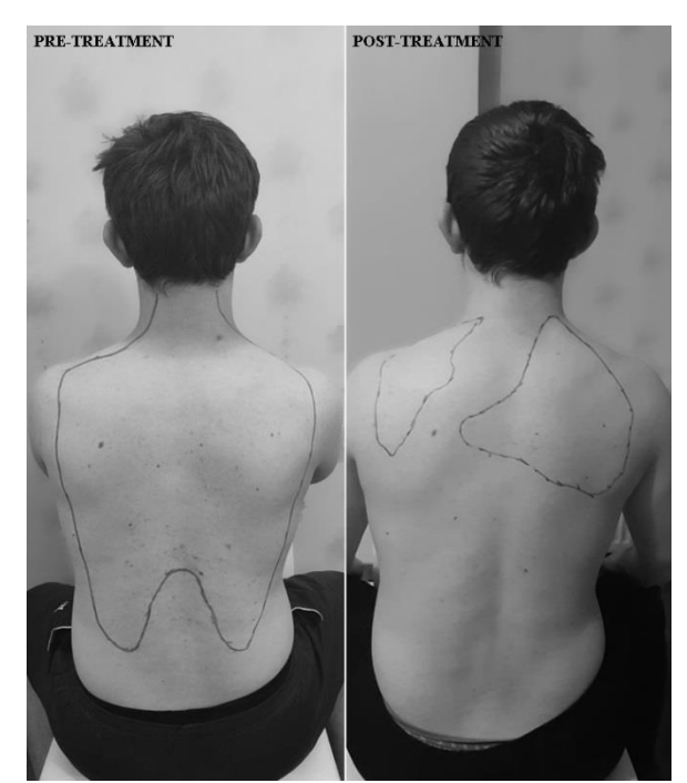
Figure 2: Mapping of pre-treatment and post-treatment pain areas