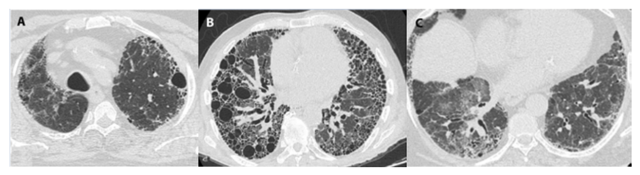
Figure 1. Axial HRCT images of a patient in the severe form ILD group.

Table 2. Demographic distribution within groups.