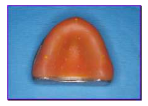
Figure 3. Weighed using an analytical balance with accuracy of 0.0001 \ensuremath{\mathsf{g}}

After the polymerization of the silicone material, the resulting silicon film trimmed at the borderline mark of the master cast and removed from the denture. Then it was weighed using an analytical balance with accuracy of 0.0001 g (MODEL ag 204, Mettler Toledo, Switzerland) (Fig 3). This procedure was done in dublicate for each specimen, and the average value was recorded to evaluate the internal adaptation of the each specimen.