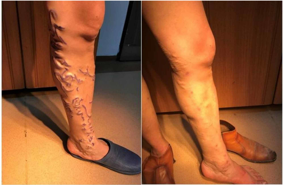
FIGURE 4: Pre and postoperative view