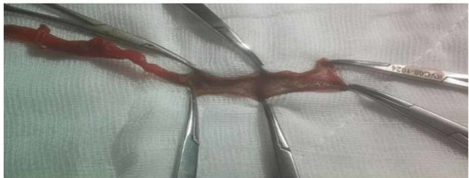
FIGURE 1: View of the saphenous vein after RF ablation